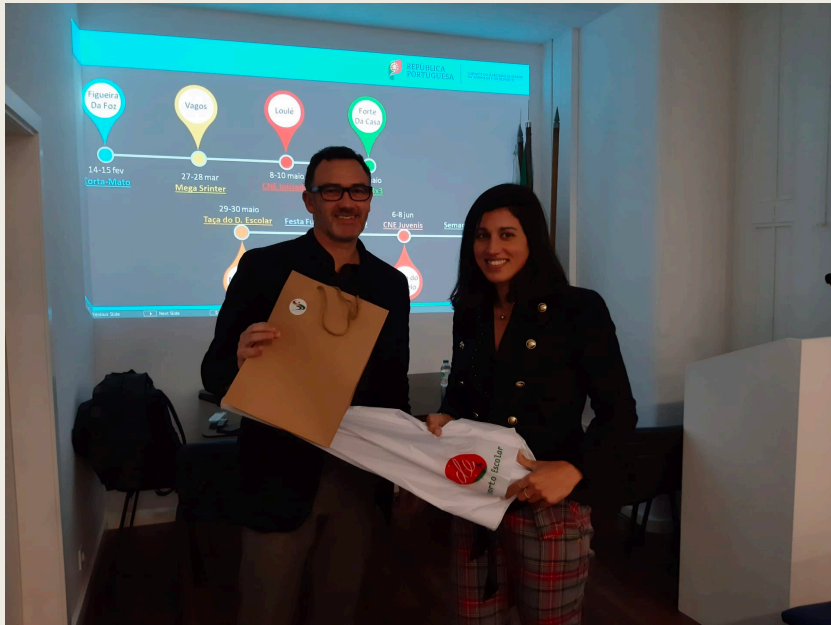
Youth Commission Session on sport in high school